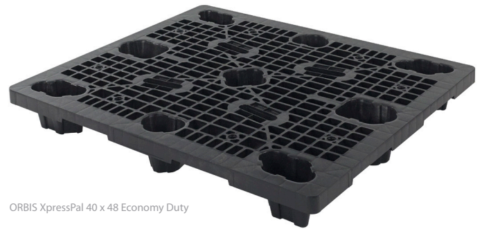
ORBIS XpressPal 40 x 48 Economy Duty

Based on the industry standard footprint, the ORBIS 40 x 48 Economy Duty XpressPal is designed for storage and shipment of mixed loads of food, grocery and consumer packaged goods in a retail environment. This economical pallet delivers the quality needed in today's fast paced distribution networks. Its injection-molded, one-piece construction sets it apart from alternative pallets by offering a hygienic design that is strong and has minimal deflection.